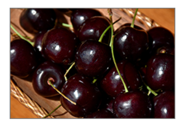
Black Tartarian Cherry fruit

Black Tartarian Cherry is smothered in stunning clusters of fragrant white flowers hanging below the branches in mid spring before the leaves. It has dark green deciduous foliage. The pointy leaves turn yellow in fall. The fruits are showy dark red drupes with black overtones, which are carried in abundance in mid summer. The fruit can be messy if allowed to drop on the lawn or walkways, and may require occasional clean-up. The smooth dark red bark adds an interesting dimension to the landscape.