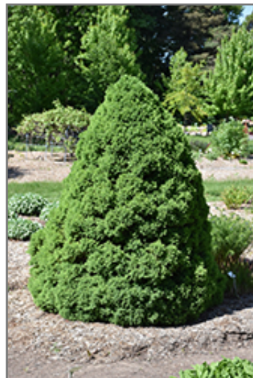
Dwarf Alberta Spruce

Dwarf Alberta Spruce will grow to be about 6 feet tall at maturity, with a spread of 5 feet. It tends to fill out right to the ground and therefore doesn't necessarily require facer plants in front, and is suitable for planting under power lines. It grows at a slow rate, and under ideal conditions can be expected to live for 50 years or more.