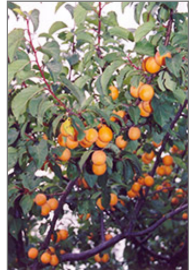
Apricot fruit