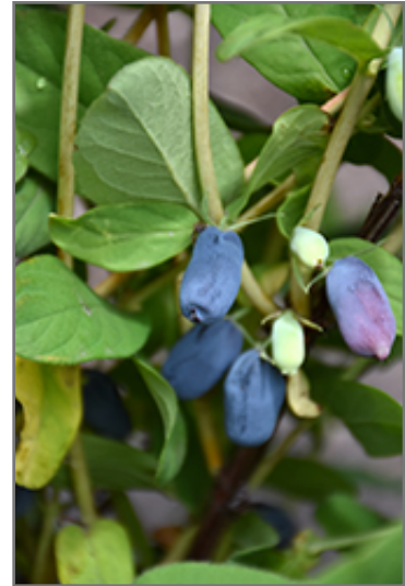
Honeybee Honeyberry fruit

Honeybee Honeyberry features subtle buttery yellow flowers along the branches from late winter to early spring. It has green deciduous foliage. The narrow leaves do not develop any appreciable fall colour. It features an abundance of magnificent deep purple berries with powder blue overtones from late spring to early summer.