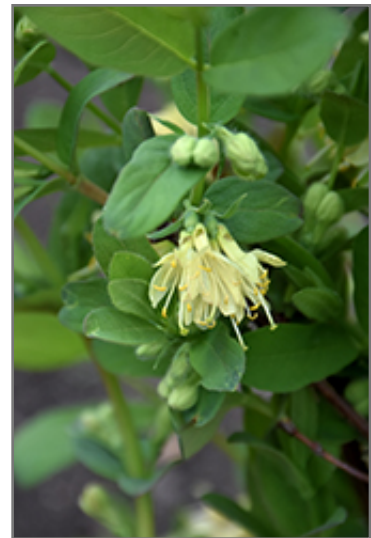
Honeybee Honeyberry flowers