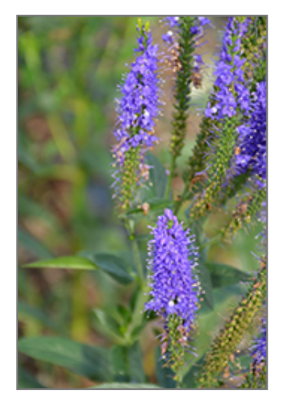
Marietta Speedwell flowers

Marietta Speedwell is recommended for the following landscape applications;