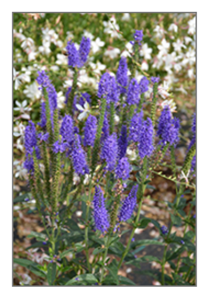
Marietta Speedwell flowers