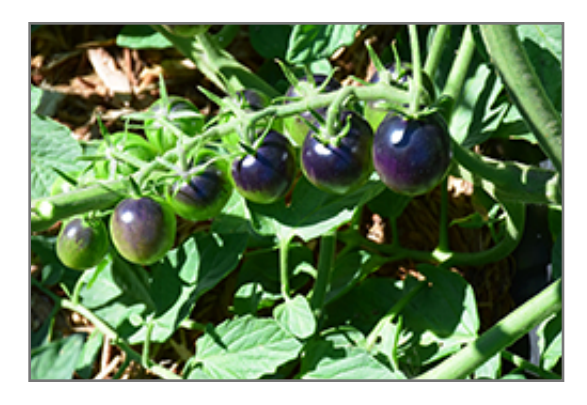
Midnight Snack Tomato fruit

Midnight Snack Tomato will grow to be about 6 feet tall at maturity, with a spread of 4 feet. When planted in rows, individual plants should be spaced approximately 3 feet apart. Because of its vigorous growth habit, it may require staking or supplemental support. This fast-growing vegetable plant is an annual, which means that it will grow for one season in your garden and then die after producing a crop.