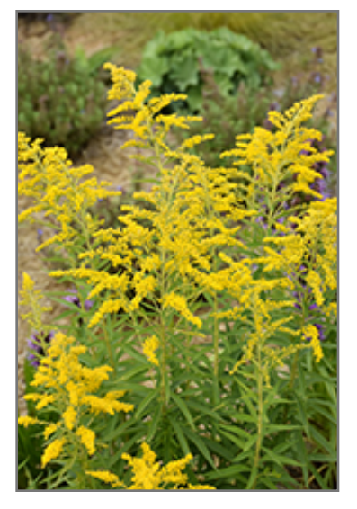
Canadian Goldenrod flowers

This plant will require occasional maintenance and upkeep, and is best cleaned up in early spring before it resumes active growth for the season. It is a good choice for attracting bees and butterflies to your yard, but is not particularly attractive to deer who tend to leave it alone in favor of tastier treats. Gardeners should be aware of the following characteristic(s) that may warrant special consideration;