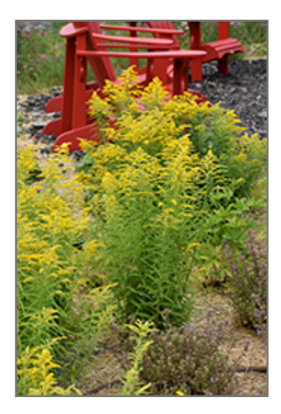
Canadian Goldenrod in bloom