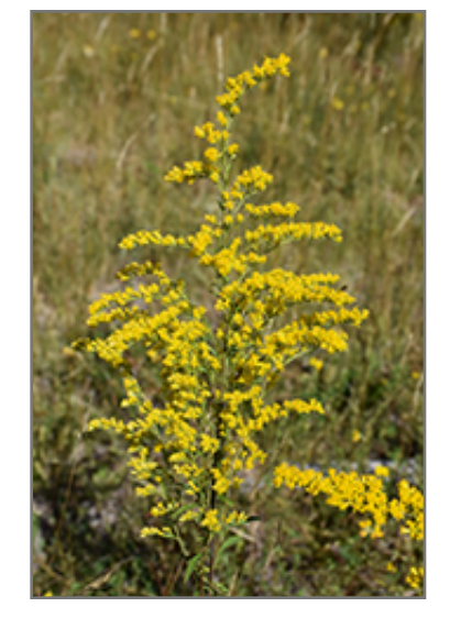
Canadian Goldenrod flowers

This plant does best in full sun to partial shade. It prefers to grow in average to moist conditions, and shouldn't be allowed to dry out. It is not particular as to soil type or pH. It is highly tolerant of urban pollution and will even thrive in inner city environments. This species is native to parts of North America. It can be propagated by division.