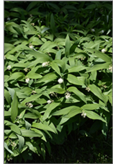
Starry False Solomon's Seal flowers

Starry False Solomon's Seal is recommended for the following landscape applications;