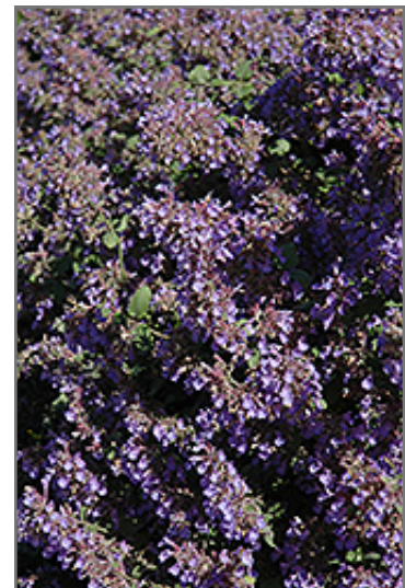
Walker's Low Catmint flowers