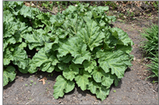
Crimson Red Rhubarb

Other Names: Crimson, Crimson Wine, Crimson Cherry Rhubarb