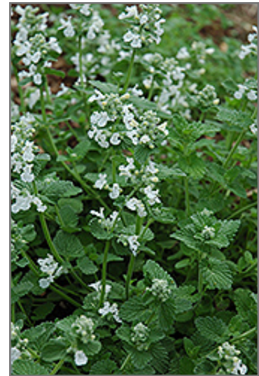
Snowflake Catmint flowers

Snowflake Catmint will grow to be about 10 inches tall at maturity, with a spread of 12 inches. Its foliage tends to remain low and dense right to the ground. It grows at a fast rate, and under ideal conditions can be expected to live for approximately 10 years. As an herbaceous perennial, this plant will usually die back to the crown each winter, and will regrow from the base each spring. Be careful not to disturb the crown in late winter when it may not be readily seen!