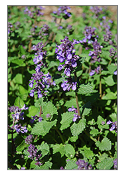
Dropmore Blue Catmint flowers