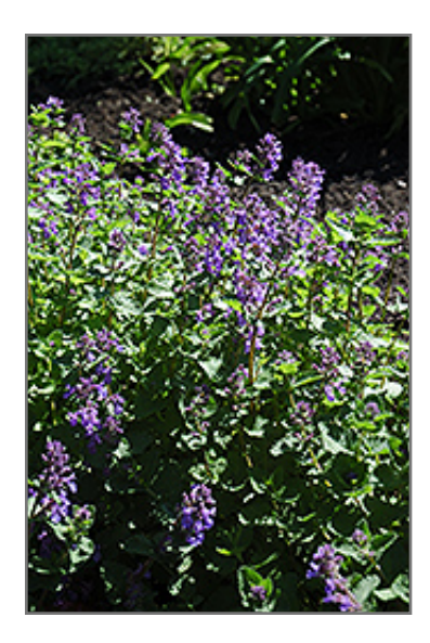
Dropmore Blue Catmint in bloom