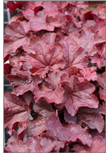
Northern Exposure Red Coral Bells foliage

Northern Exposure Red Coral Bells is recommended for the following landscape applications;