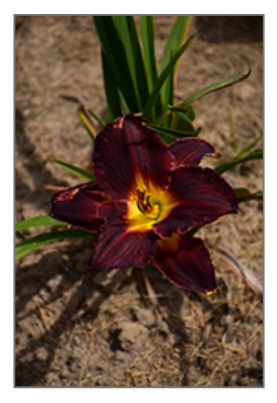
Black Stockings Daylily flowers

Showy, large, velvety, burgundy-purple trumpets with contrasting yellow throats and ruffled petal edges; sturdy, strong, easy to care for, great grassy texture and form; blooms in late spring to early summer, with some intermittent rebloom later