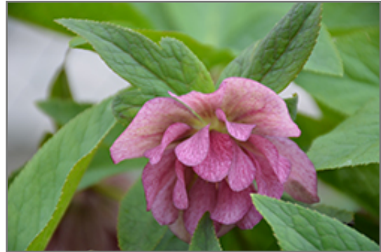
Wedding Party Wedding Crasher Hellebore flowers