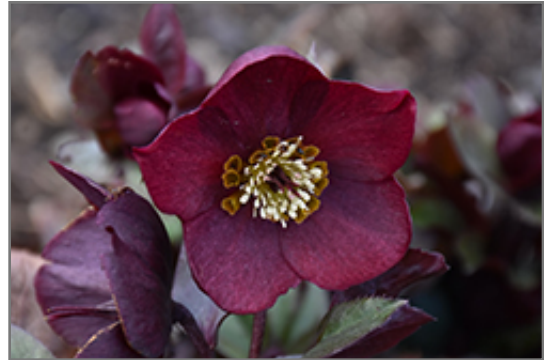
Honeymoon Rome In Red Hellebore flowers

Honeymoon Rome In Red Hellebore is recommended for the following landscape applications;