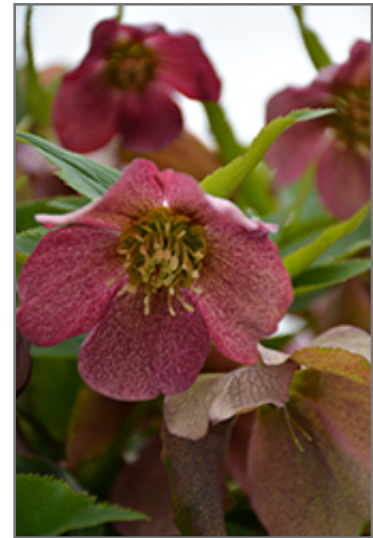
Winter Thrillers Pink Parachutes Hellebore flowers