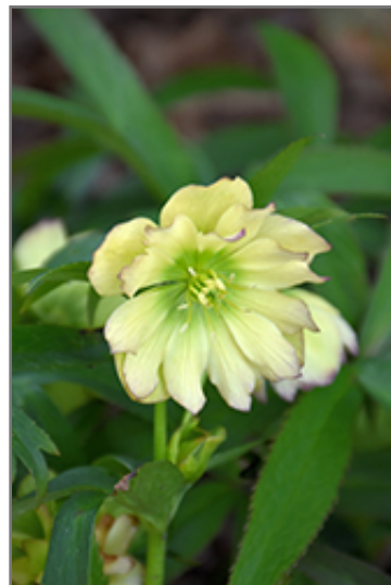
Wedding Party First Dance Hellebore flowers