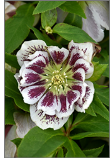
Wedding Party Confetti Cake Hellebore flowers

This is a relatively low maintenance plant, and should be cut back in late fall in preparation for winter. Deer don't particularly care for this plant and will usually leave it alone in favor of tastier treats. It has no significant negative characteristics.