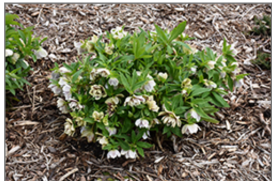
Wedding Party Confetti Cake Hellebore in bloom