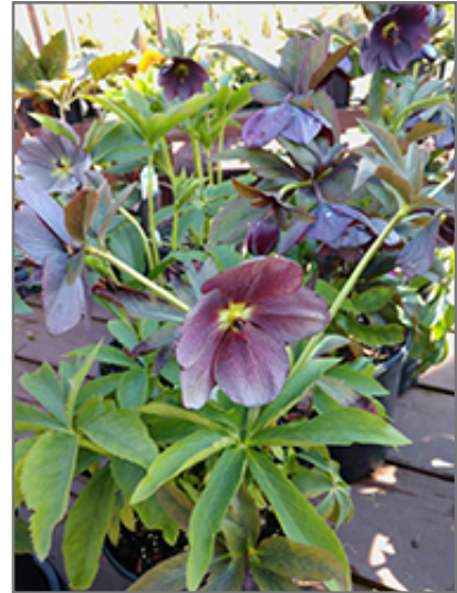
Winter Jewels Blue Diamond Hellebore flowers