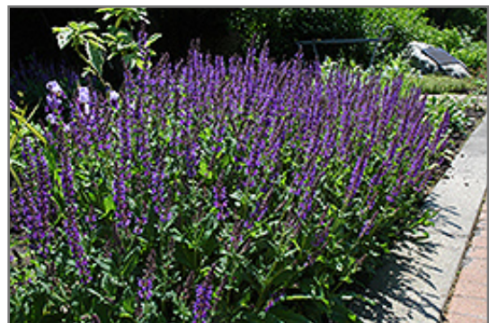
Showy Catmint in bloom