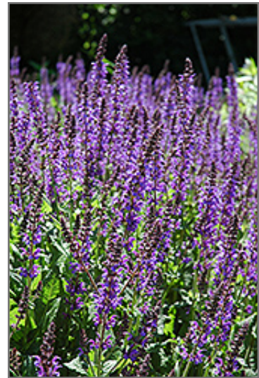
Showy Catmint flowers