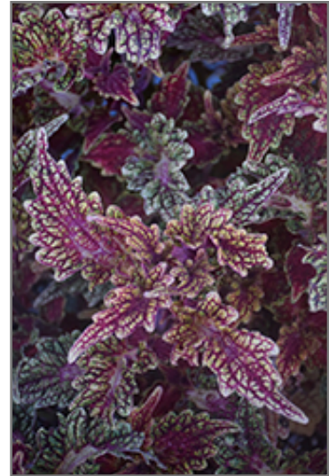
Stained Glassworks Golden Gate Coleus foliage