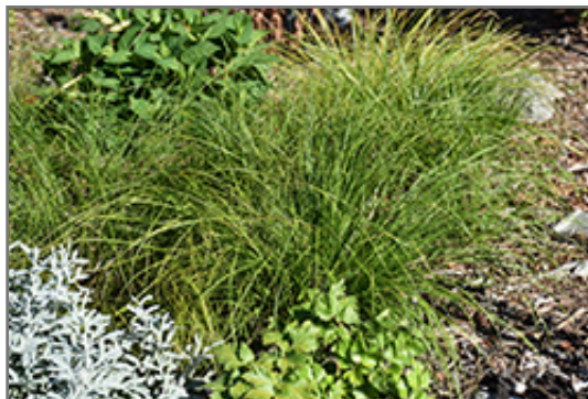
Pennsylvania Sedge