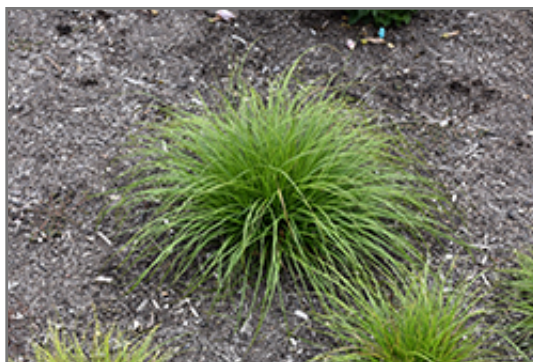
Pennsylvania Sedge