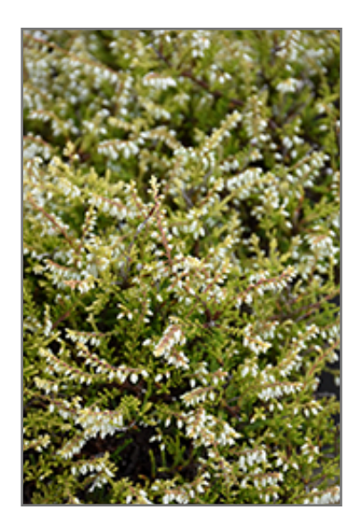
Kinlochruel Heather flowers

A compact, low growing selection, with spikes of white, bell-shaped flowers throughout summer, over bright green leaves that bronze in winter; very particular about growing conditions; needs acidic organic soil, and will die in anything else