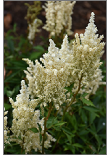
Short 'N Sweet Whiteberry Astilbe flowers

Short 'N Sweet Whiteberry Astilbe is recommended for the following landscape applications;