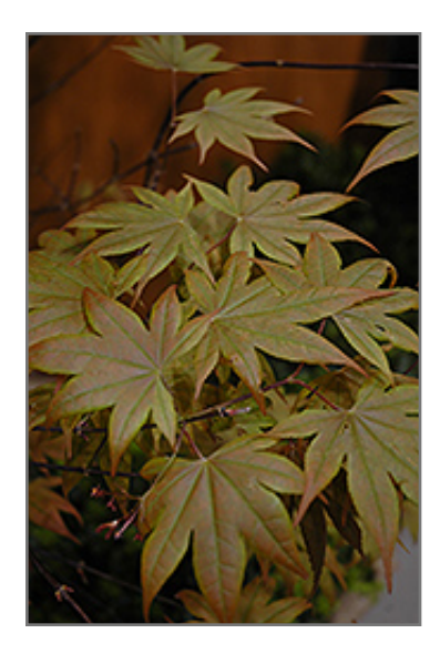
Purple-Leaf Japanese Maple foliage