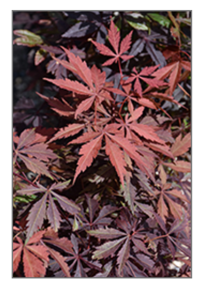
Purple-Leaf Japanese Maple foliage

This tree does best in full sun to partial shade. You may want to keep it away from hot, dry locations that receive direct afternoon sun or which get reflected sunlight, such as against the south side of a white wall. It prefers to grow in average to moist conditions, and shouldn't be allowed to dry out. This plant should not require much in the way of fertilizing once established, although it may appreciate a shot of general-purpose fertilizer from time to time early in the growing season. It is not particular as to soil pH, but grows best in rich soils. It is somewhat tolerant of urban pollution. Consider applying a thick mulch around the root zone in winter to protect it in exposed locations or colder microclimates. This is a selected variety of a species not originally from North America.