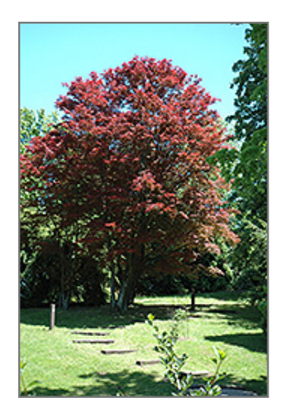
Purple-Leaf Japanese Maple