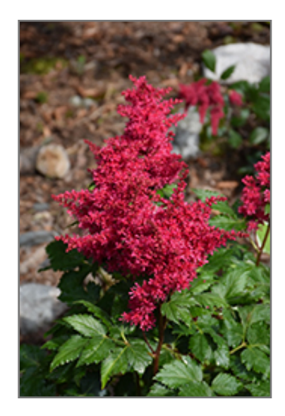
Heavy Metal Astilbe flowers

Heavy Metal Astilbe is recommended for the following landscape applications;