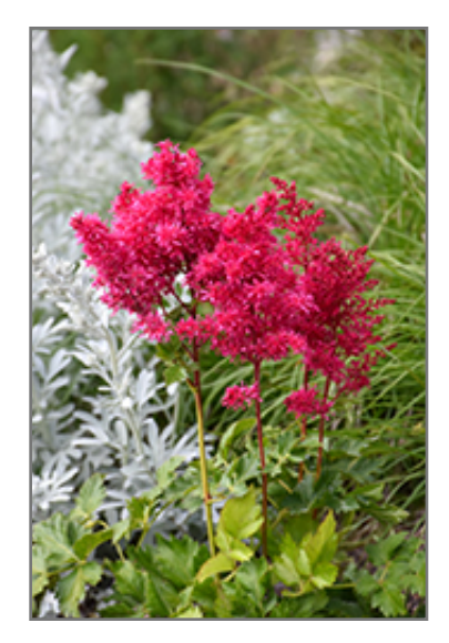
Heavy Metal Astilbe in bloom