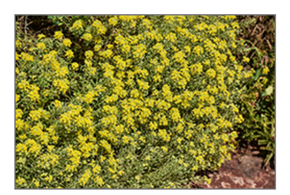
Mountain Alyssum flowers

Mountain Alyssum is recommended for the following landscape applications;