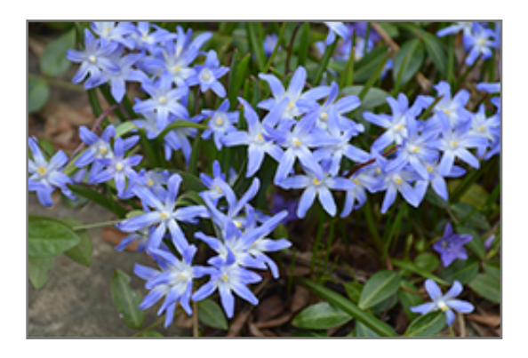
Glory of the Snow flowers