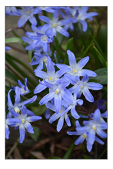
Glory of the Snow flowers