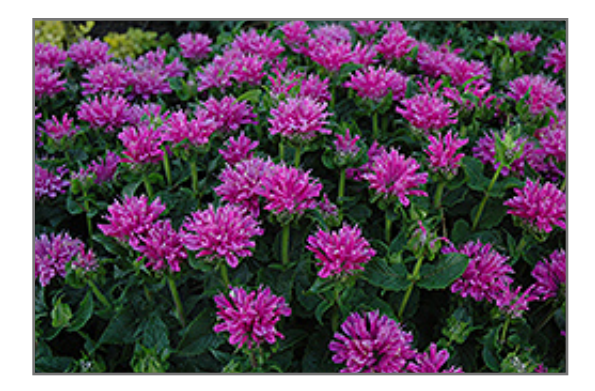
Petite Delight Beebalm flowers