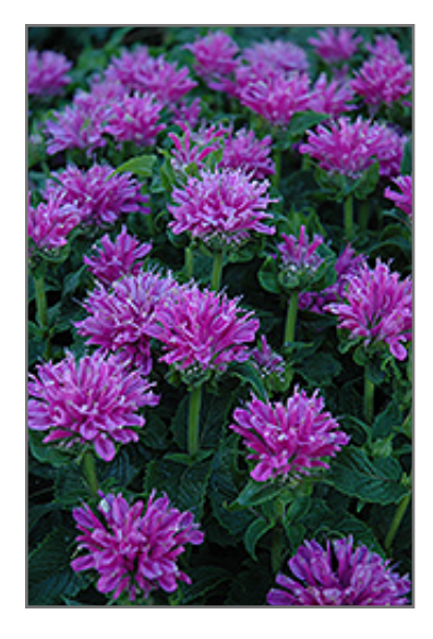
Petite Delight Beebalm flowers

Petite Delight Beebalm is recommended for the following landscape applications;