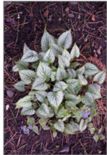
Silver Charm Bugloss in bloom

This vigorous, compact selection features attractive, heart shaped leaves of silver, with contrasting dark green veins and edges; clusters of tiny blue flowers in spring; a perfect accent plant for shade areas; best in moist, rich, well drained soil