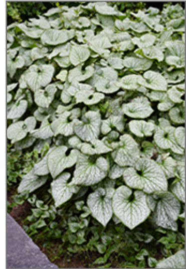
Alchemy Silver Bugloss

Alchemy Silver Bugloss is recommended for the following landscape applications;