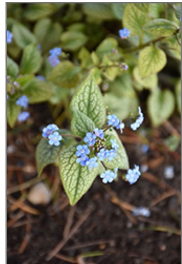
Alchemy Silver Bugloss flowers