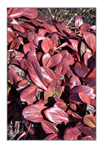
Flirt Bergenia foliage

Flirt Bergenia is recommended for the following landscape applications;