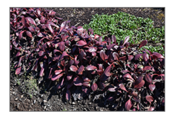
Flirt Bergenia foliage