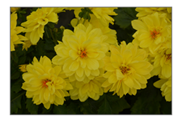
Hypnotica Yellow Dahlia flowers