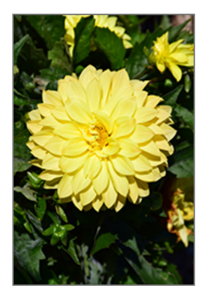
Hypnotica Yellow Dahlia flowers

Hypnotica Yellow Dahlia is an herbaceous annual with an upright spreading habit of growth. Its medium texture blends into the garden, but can always be balanced by a couple of finer or coarser plants for an effective composition.