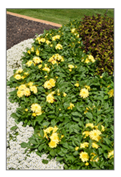
Hypnotica Yellow Dahlia in bloom

Hypnotica Yellow Dahlia is a fine choice for the garden, but it is also a good selection for planting in outdoor pots and containers. It is often used as a 'filler' in the 'spiller-thriller-filler' container combination, providing a mass of flowers against which the larger thriller plants stand out. Note that when growing plants in outdoor containers and baskets, they may require more frequent waterings than they would in the yard or garden.