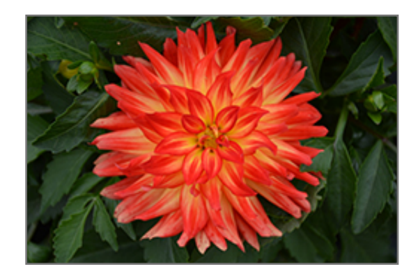
Hypnotica Icarus Dahlia flowers