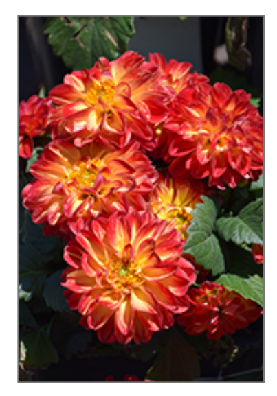
Hypnotica Icarus Dahlia flowers

Hypnotica Icarus Dahlia is an herbaceous annual with an upright spreading habit of growth. Its medium texture blends into the garden, but can always be balanced by a couple of finer or coarser plants for an effective composition.