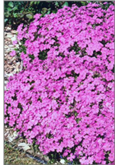
Arctic Phlox flowers