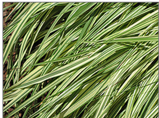
Variegated Moor Grass foliage