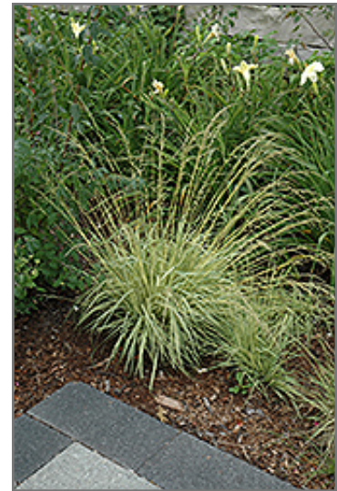
Variegated Moor Grass