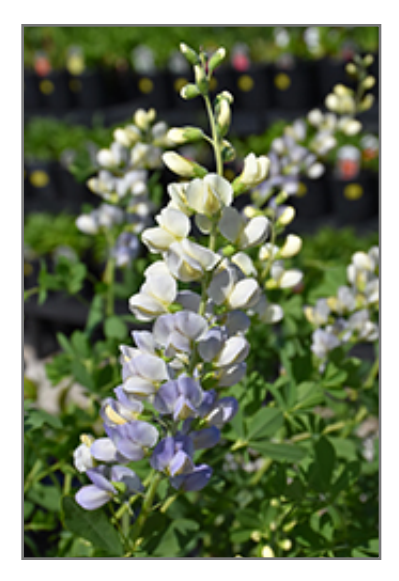
Lunar Eclipse Prairieblues False Indigo flowers

Spectacular spikes of butter-cream pea-flowers progress to lavender, then mature to dark purple-blue, above attractive blue-green foliage in early summer; an outstanding vertical floral display as an accent in the garden or landscape