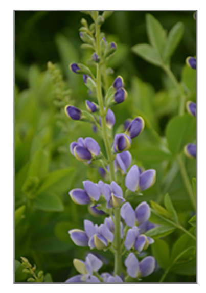
Blue Sky False Indigo flowers

Blue Sky False Indigo is an herbaceous perennial with an upright spreading habit of growth. Its medium texture blends into the garden, but can always be balanced by a couple of finer or coarser plants for an effective composition.