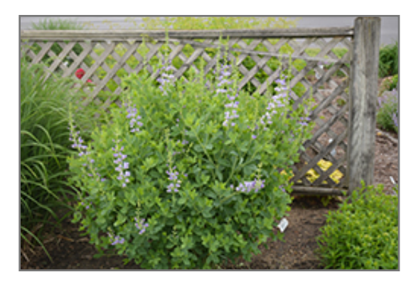
Blue Sky False Indigo in bloom

This is a relatively low maintenance plant, and is best cleaned up in early spring before it resumes active growth for the season. It is a good choice for attracting bees and butterflies to your yard, but is not particularly attractive to deer who tend to leave it alone in favor of tastier treats. It has no significant negative characteristics.