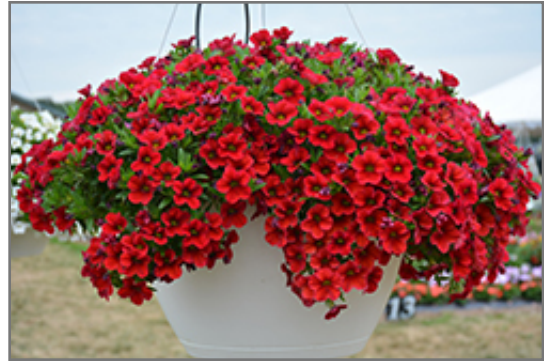
MiniFamous Uno Red Calibrachoa in bloom

MiniFamous Uno Red Calibrachoa is a fine choice for the garden, but it is also a good selection for planting in outdoor containers and hanging baskets. Because of its trailing habit of growth, it is ideally suited for use as a 'spiller' in the 'spiller-thriller-filler' container combination; plant it near the edges where it can spill gracefully over the pot. Note that when growing plants in outdoor containers and baskets, they may require more frequent waterings than they would in the yard or garden.