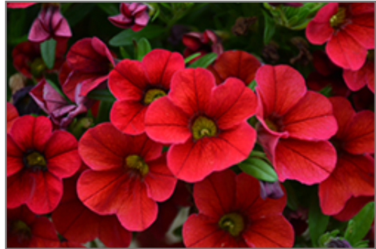
MiniFamous Uno Red Calibrachoa flowers

MiniFamous Uno Red Calibrachoa is a dense herbaceous annual with a trailing habit of growth, eventually spilling over the edges of hanging baskets and containers. Its medium texture blends into the garden, but can always be balanced by a couple of finer or coarser plants for an effective composition.