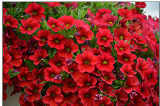
MiniFamous Uno Red Calibrachoa flowers