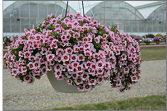
MiniFamous Uno Pink Strike Calibrachoa in bloom

MiniFamous Uno Pink Strike Calibrachoa is a fine choice for the garden, but it is also a good selection for planting in outdoor containers and hanging baskets. Because of its trailing habit of growth, it is ideally suited for use as a 'spiller' in the 'spiller-thriller-filler' container combination; plant it near the edges where it can spill gracefully over the pot. Note that when growing plants in outdoor containers and baskets, they may require more frequent waterings than they would in the yard or garden.