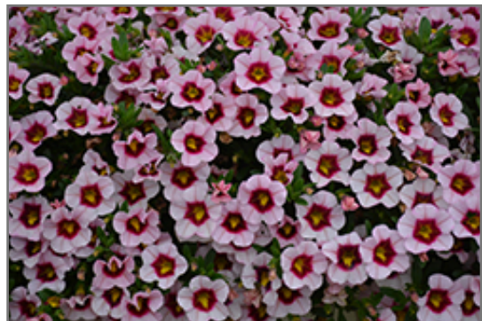
MiniFamous Uno Pink Strike Calibrachoa flowers