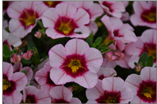
MiniFamous Uno Pink Strike Calibrachoa flowers

MiniFamous Uno Pink Strike Calibrachoa is a dense herbaceous annual with a trailing habit of growth, eventually spilling over the edges of hanging baskets and containers. Its medium texture blends into the garden, but can always be balanced by a couple of finer or coarser plants for an effective composition.