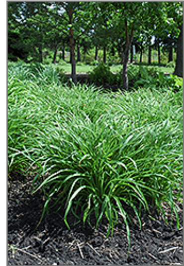
Moor Grass

Moor Grass will grow to be about 12 inches tall at maturity extending to 24 inches tall with the flowers, with a spread of 24 inches. Its foliage tends to remain dense right to the ground, not requiring facer plants in front. It grows at a slow rate, and under ideal conditions can be expected to live for approximately 15 years. As an herbaceous perennial, this plant will usually die back to the crown each winter, and will regrow from the base each spring. Be careful not to disturb the crown in late winter when it may not be readily seen!