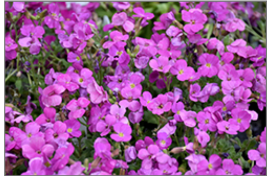
Axcent Lilac Rock Cress flowers