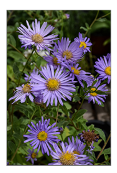
Monch Frikart's Aster flowers