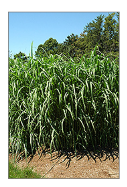
Giant Silver Grass

Giant Silver Grass will grow to be about 7 feet tall at maturity, with a spread of 4 feet. It tends to be leggy, with a typical clearance of 1 foot from the ground, and should be underplanted with lower-growing perennials. It grows at a medium rate, and under ideal conditions can be expected to live for approximately 20 years. As an herbaceous perennial, this plant will usually die back to the crown each winter, and will regrow from the base each spring. Be careful not to disturb the crown in late winter when it may not be readily seen!