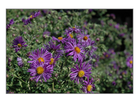
Davey's True Blue Aster flowers

Volumes of purplish-blue flowers with yellow centers over attractive dark green leaves; prefers cool, moist soil; water regularly from the root zone instead of from the top to reduce fungal disease, and to encourage more blooms