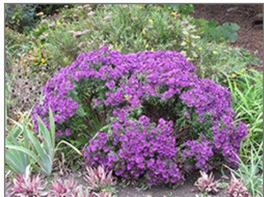
Believer Purple Aster in bloom