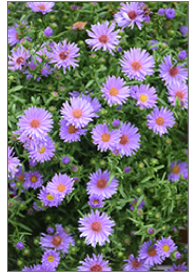
Believer Purple Aster flowers

Believer Purple Aster is recommended for the following landscape applications;