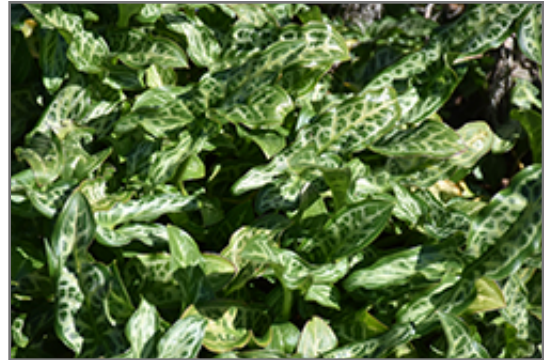
White Winter Arum foliage

White Winter Arum is recommended for the following landscape applications;