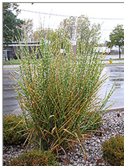
Porcupine Grass