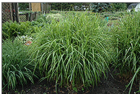
Porcupine Grass