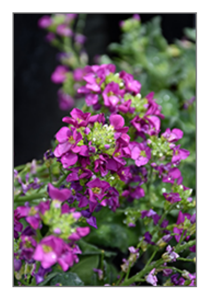
Lotti Deep Rose Wall Cress flowers

A tightly uniform, compact mounded variety that is covered with fragrant rose-pink flowers in spring for several weeks; perfect for walls and rock gardens; can shear after blooming for best appearance